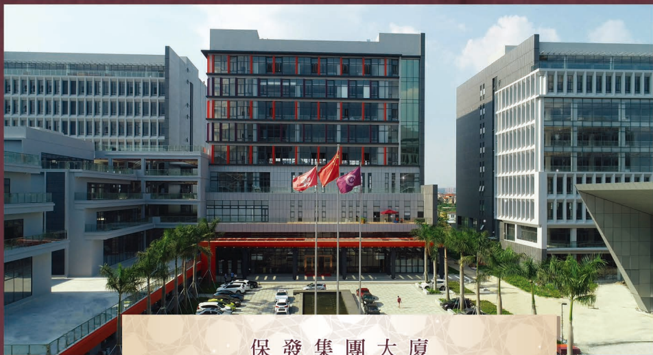
保發集團大廈 PERFECT GROUP TOWER