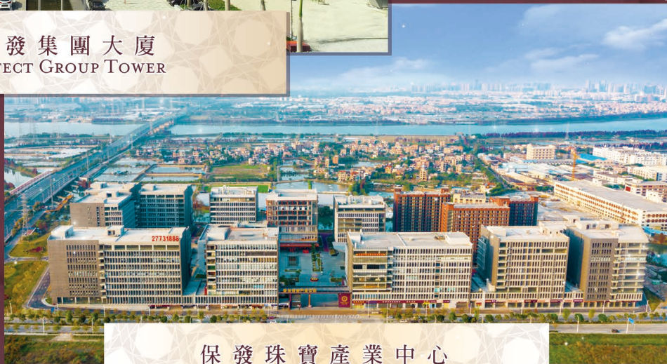
保發珠寶產業中心 PERFECT GROUP JEWELLERY INDUSTRY PARK