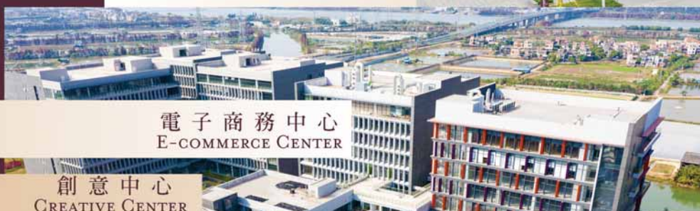
創意中心 CREATIVE CENTER