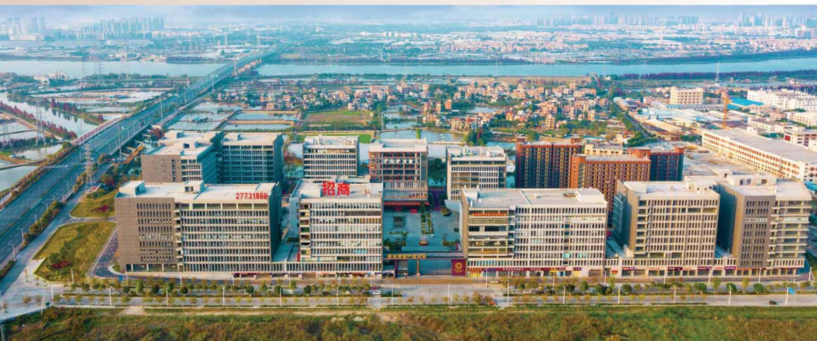
保發博覽館 PERFECT EXPO