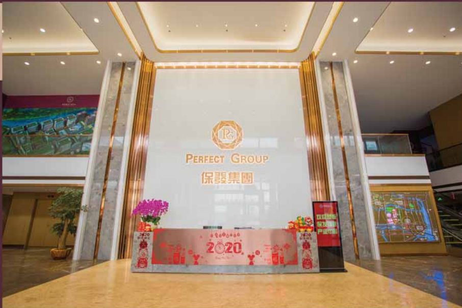
保發集團大廈 - 大堂 PERFECT TOWER - LOBBY